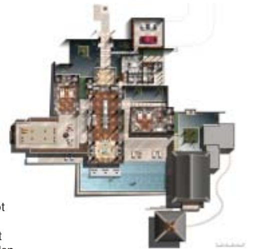
ABOVE: Exterior perspective of the Cape Yamu concept villa.